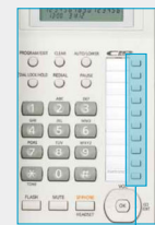
One-Touch Dial Buttons

You can store up to 20 phone numbers in the one-touch dial buttons (10 numbers in both upper and lower memory locations). One-touch dial buttons save you time and trouble when calling a client, customer, or associate you often speak with.