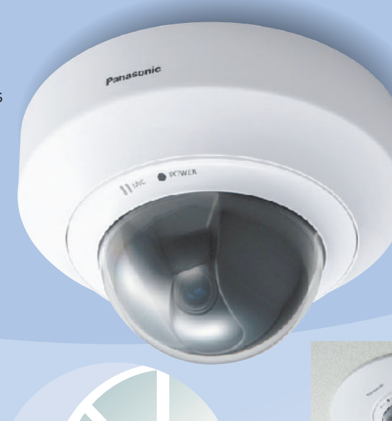
(Using the optional ceiling flush mount bracket.)